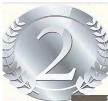
Student Success and Student Life "A Swampy Christmas"