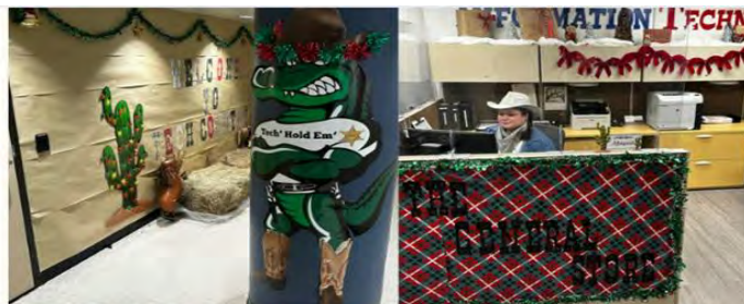
Information Technology "Welcome to Tech Country"