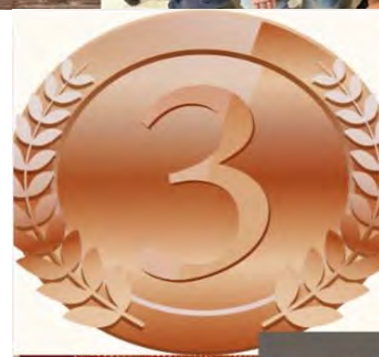
University Relations "Take the UHD Express to the North Pole"