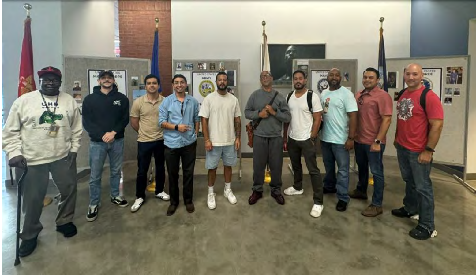
In photo: Members of the UHD Student Veterans Organization