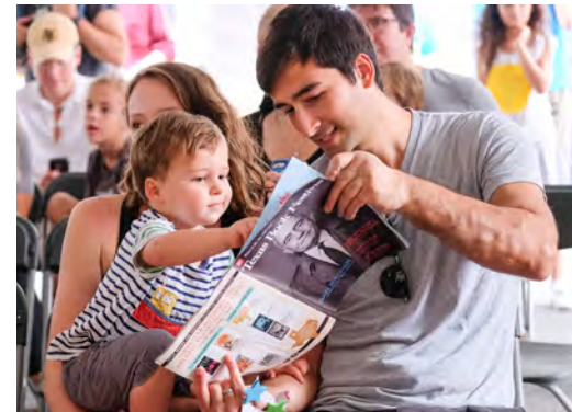
Photos from past Texas Book Festivals.