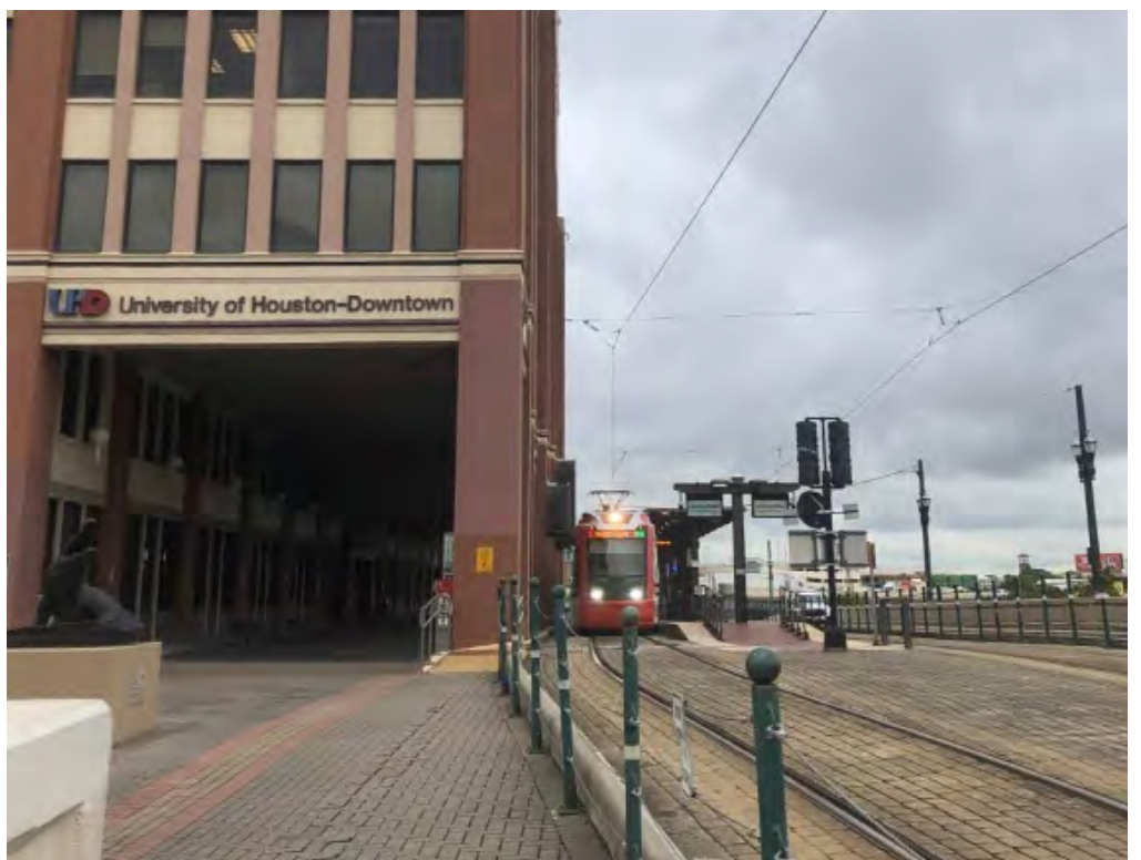
UHD partners with METRO to subsidize 25% of monthly fare costs to the UHD community.