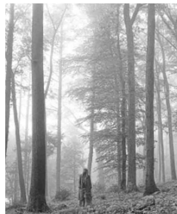
Cover art for Swift's newest album, "folklore." Image courtesy of Beth Garrabrant

from their own lives. This stripped-back album with marvelous storytelling allows Taylor Swift to make her mark as one of the most talented artists in the music industry.