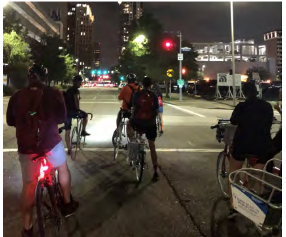
Lex Perez leads 10-mile bike ride in Downtown Houston on Oct. 25, 2019.

me to civic engagement in bicycling that stems from me doing the best I can to prevent a car from running me over."