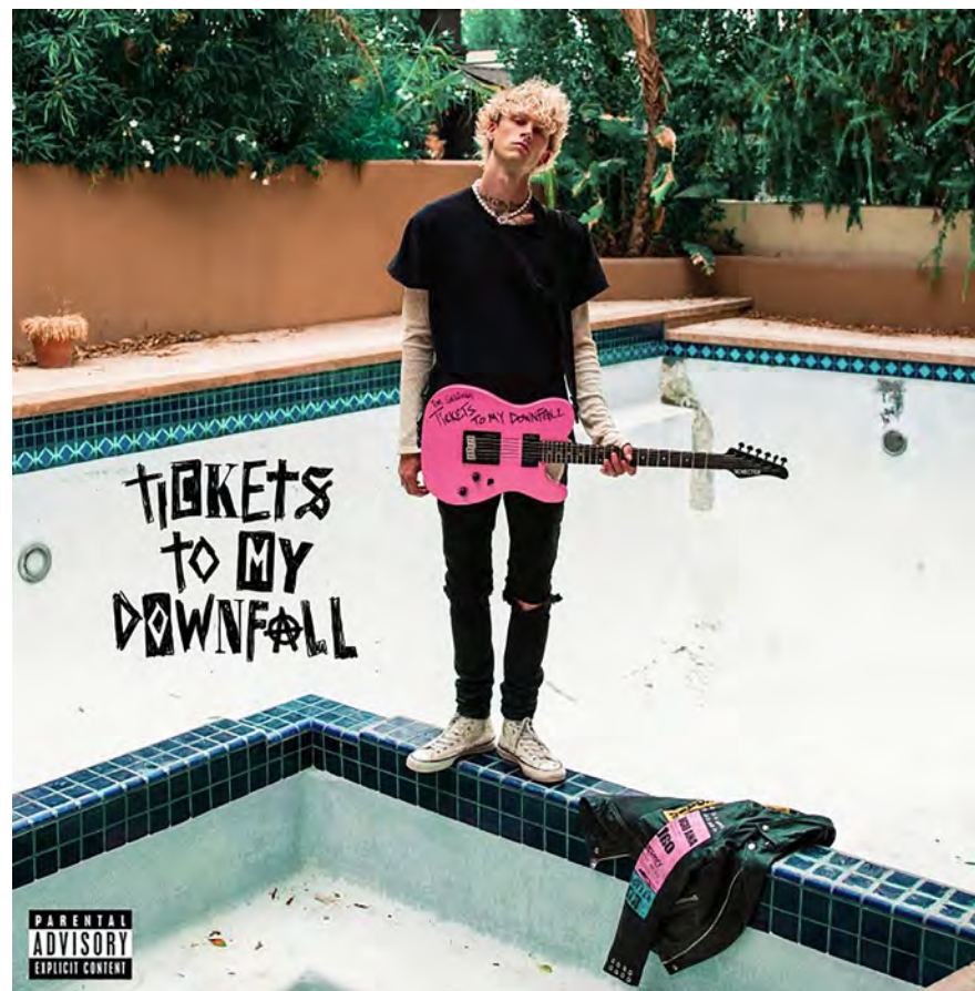
Cover of Machine Gun Kelly's latest and most successful release.

Though MGK may forfeit some fans in exploring the pop-punk scene, he has no doubt replaced and multiplied those fans with the release of "Tickets to My Downfall." Though he garnered some success as a rapper, it is clear that MGK triumphs in the pop-punk scene more than he ever did in the hip-hop genre. Regardless, "Tickets to My Downfall" proves Machine Gun Kelly is a creative and versatile artist. Though his style is ever-changing, fans anticipate the exploration and innovations in MGK's future releases.