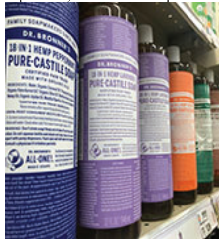
Hemp products at a Colorado Kroger.

spread of cancer cells, while CBD and THC can slow and even shrink tumors. Lastly, not only can marijuana aid ailments of the body, but it has also been known to benefit users' mental health. Medicinal marijuana has been shown to reduce the symptoms of anxiety disorders, PTSD, depression, and even schizophrenia.